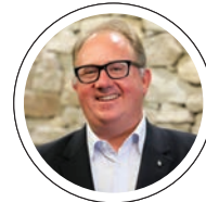
Hon. David Feeney Former Parliamentary Secretary for Defence