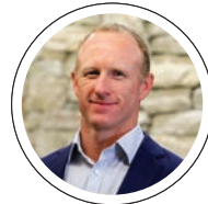
Mr Mark Donaldson VC Australian soldier and Victoria Cross recipient