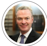
Hon. Christopher Pyne Chairman Former Australian Defence Minister

The NIOA Group board is dedicated to ensuring the organisation's objectives and behaviours are consistent with its Vision, Purpose and Values.