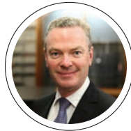
Hon. Christopher Pyne Chairman Former Australian Defence Minister

The NIOA Group board is dedicated to ensuring the organisation's objectives and behaviours are consistent with its Vision, Purpose and Values.