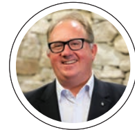
Hon. David Feeney Former Parliamentary Secretary for Defence