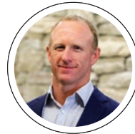
Mr Mark Donaldson VC Australian soldier and Victoria Cross recipient